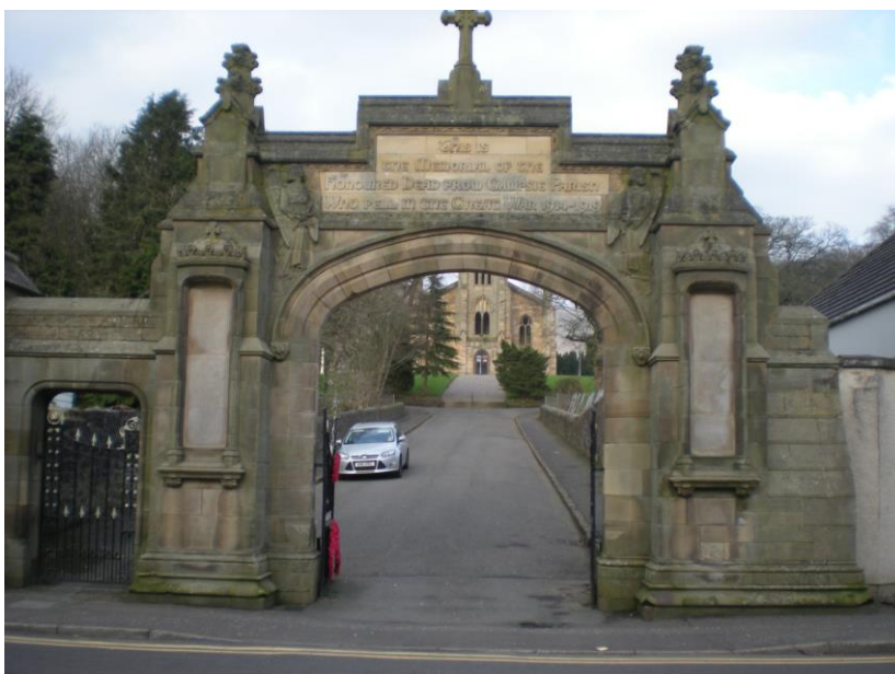
Campsie War Memorial