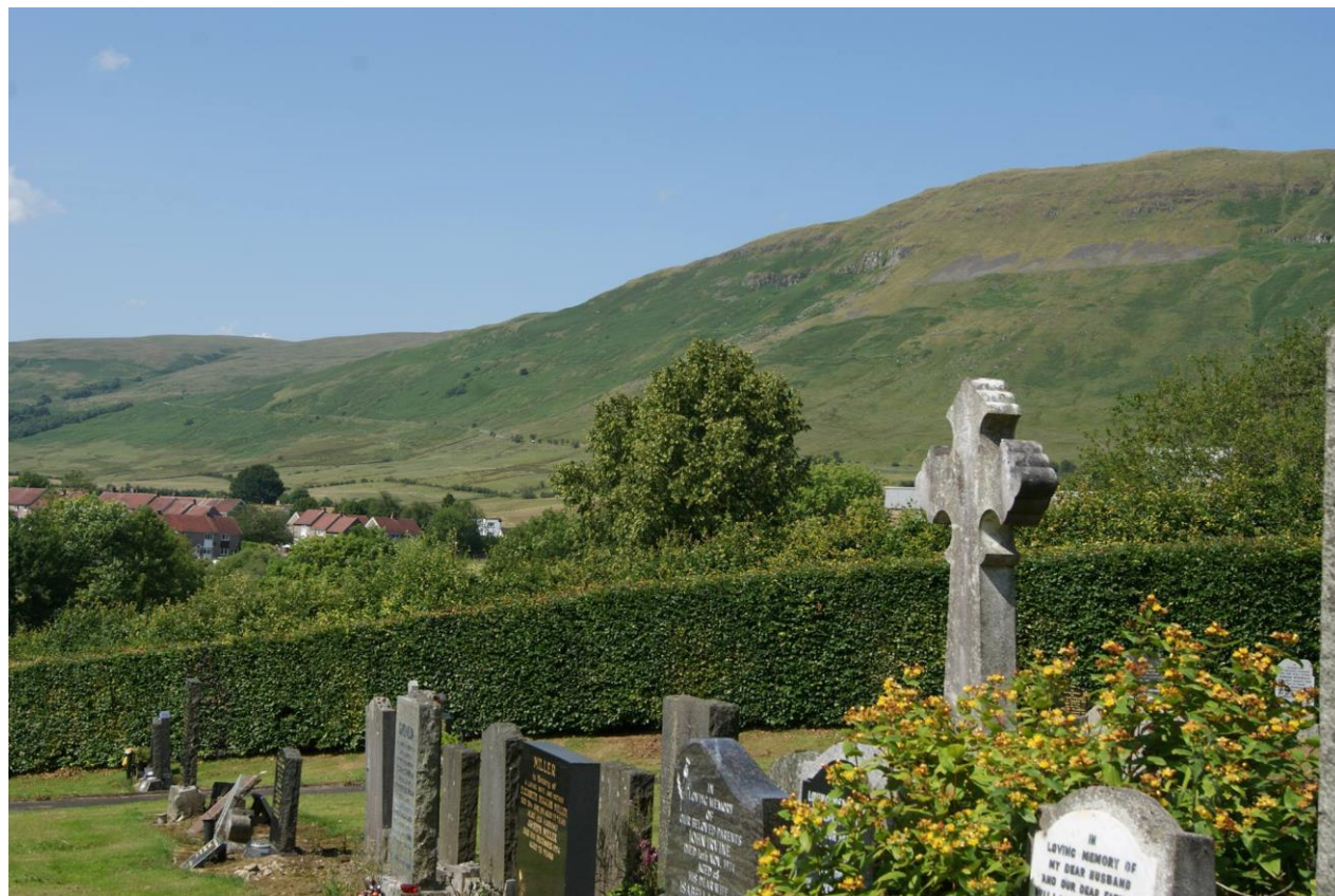
Campsie Cemetery, Lennoxtown

Campsie Cemetery, Lennoxtown, also known as Lennoxtown Cemetery, contains 15 Commonwealth War Graves – 9 from World War 1 & 6 from World War 2.